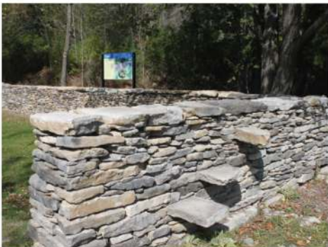
Dry Stone Wall Restoration