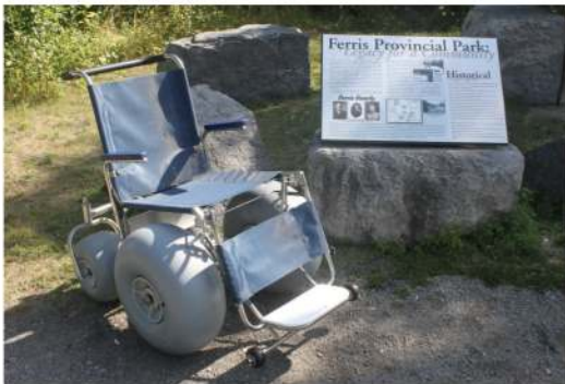
DeBug All Terrain Wheelchair