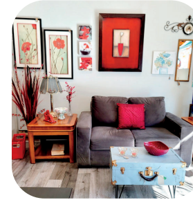
River's Edge on Front

You will be amazed at the treasures and unique items you can find in Trent Hills!