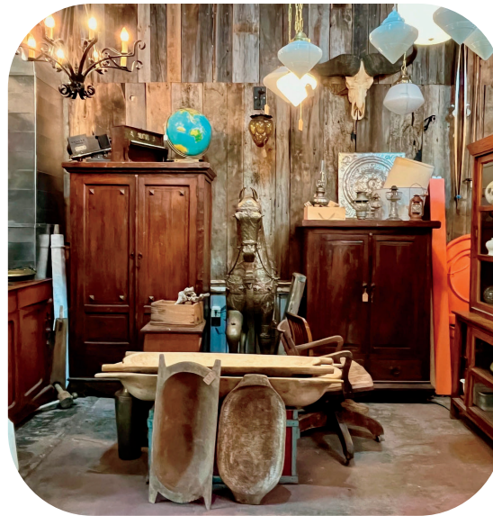
Historic House Salvage