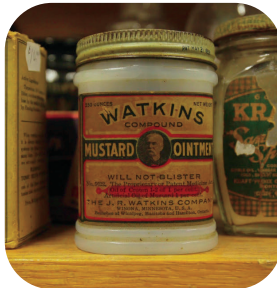
Hidden Treasure Chest