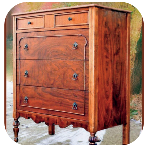
Olden Wood Revivals

The River's Edge on Front blends the present with the past in home and cottage décor and gives consumers many wonderful choices that suit and reflect any lifestyle. Drop by and see the new décor and giftware available for your home or cottage, along with their quality selection of antiques and collectibles.