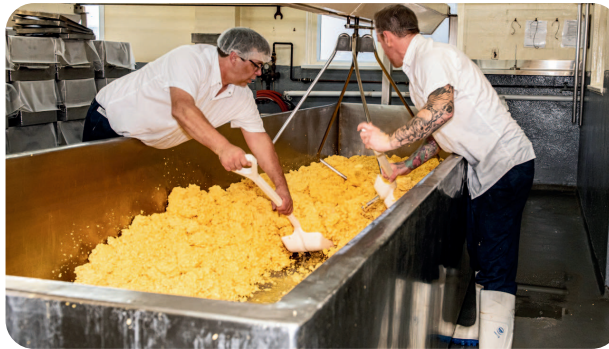
Empire Cheese and Butter Co-op

157 Cockburn St, Campbellford 705-653-3590 Monday to Saturday 9 am to 5:30pm Sunday 10 am to 4:30 pm Chocolate is made using the same time-honoured recipe that was used over 50 years ago. Selection includes chocolate covered almonds and pecans, mint meltaways, caramel whirls, dark & milk chocolate bars.