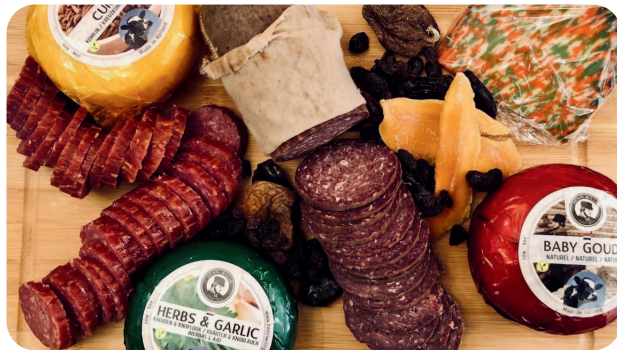
The Village Pantry

27 Main St, Warkworth 613-921-2604 7 days a week from 10:30 am to 4:30 pm Culinary store featuring specialty cheeses, gourmet ingredients, kitchen implements, chocolate, candy, cookies and more.