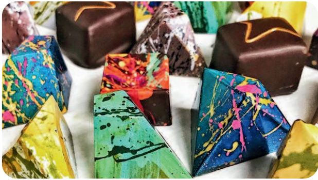
Centre and Main Chocolate Co.