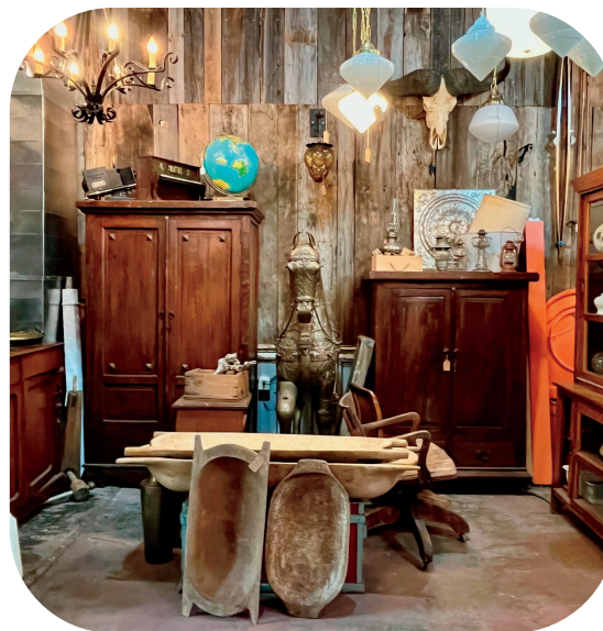
Historic House Salvage

To reach the Meyersburg Flea Market, head south on County Rd 30 for 5 km