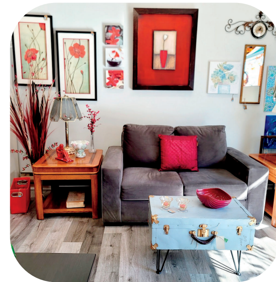
River's Edge on Front